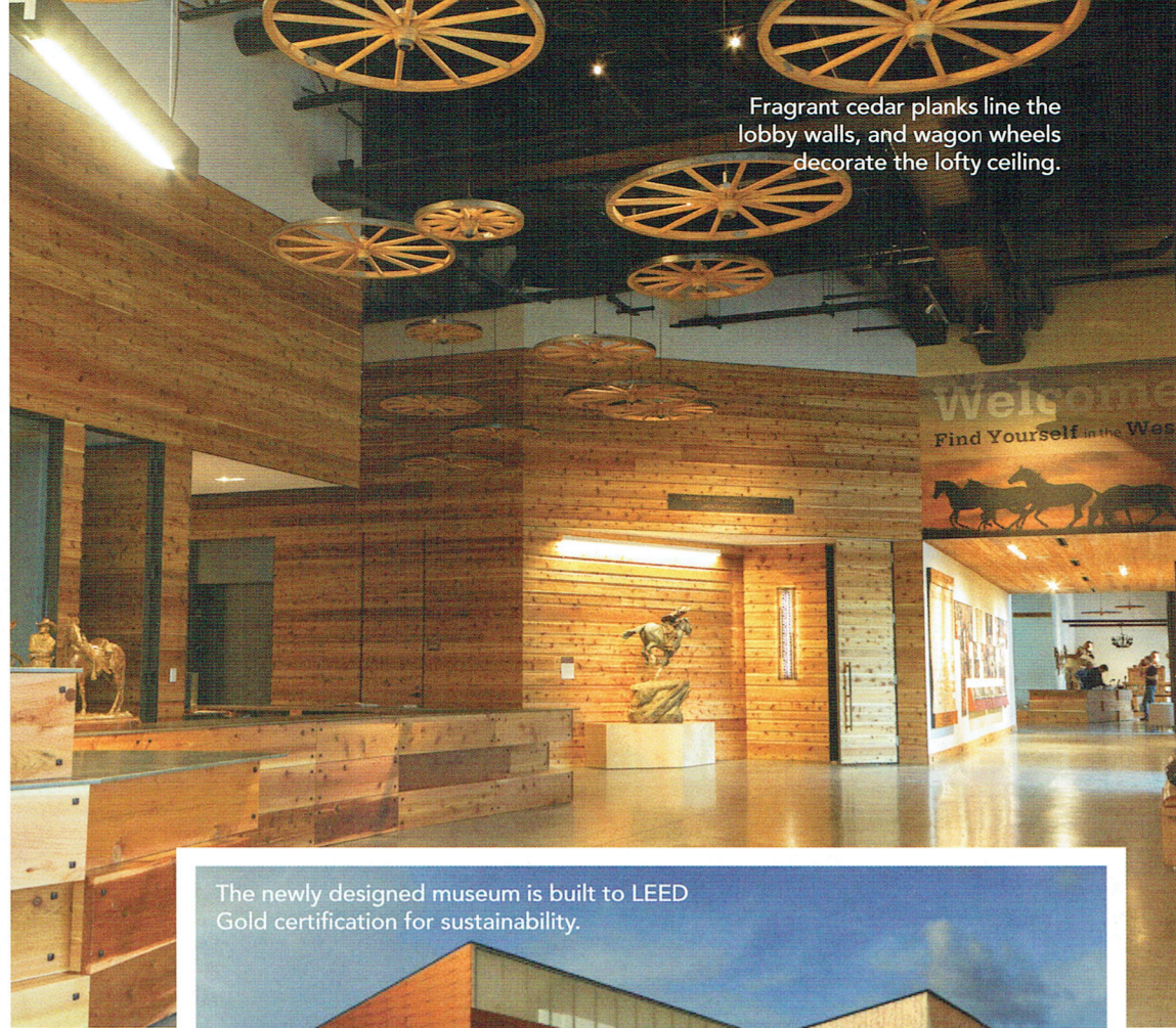
Fragrant cedar planks line the lobby walls, and wagon wheels decorate the lofty ceiling.