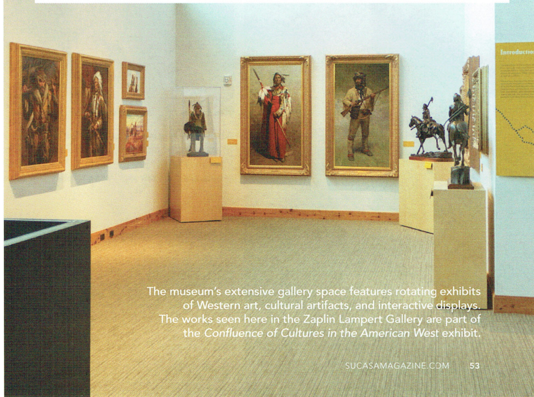
The museum's extensive gallery space features rotating exhibits of Western art, cultural artifacts, and interactive displays. The works seen here in the Zaplin Lampert Gallery are part of the Confluence of Cultures in the American West exhibit.