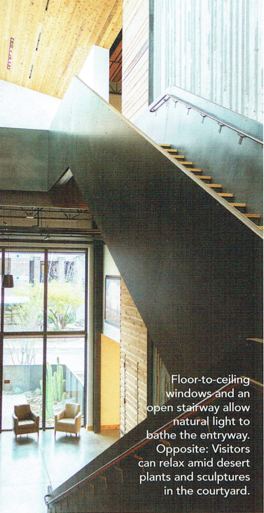
Floor-to-ceiling windows and an open stairway allow natural light to bathe the entryway. Opposite: Visitors can relax amid desert plants and sculptures in the courtyard.