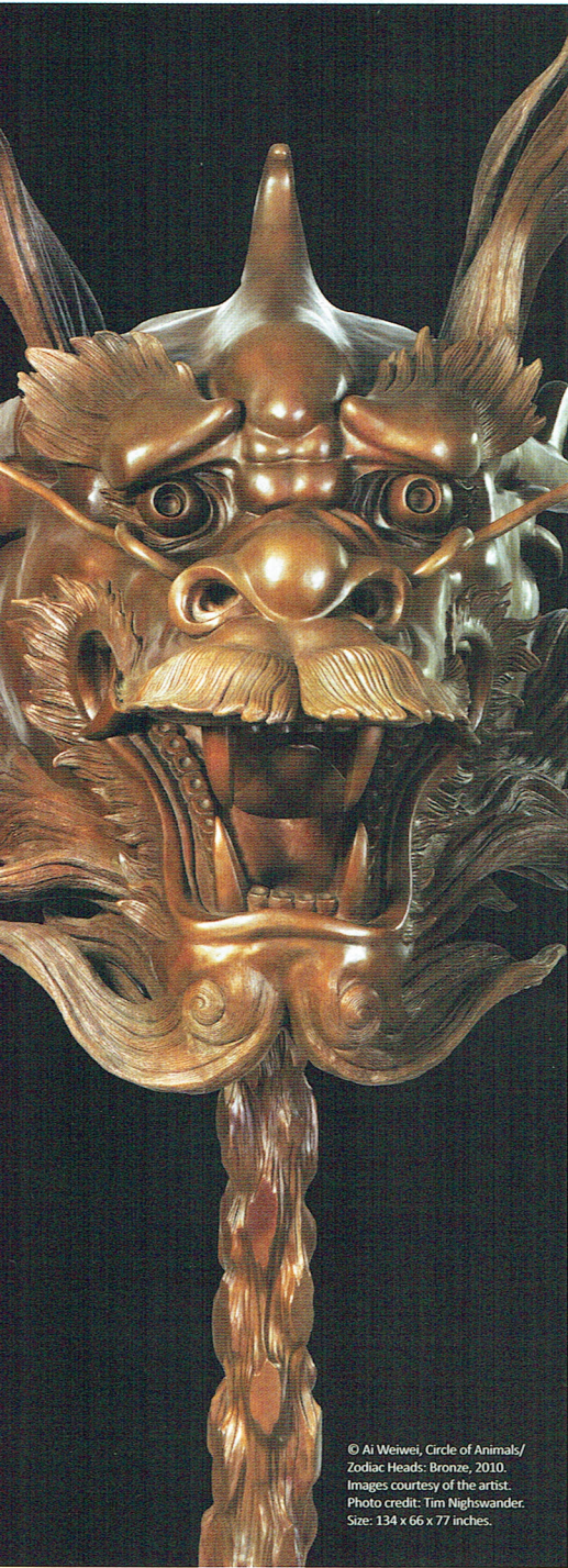
© Ai Weiwei, Circle of Animals/ Zodiac Heads: Bronze, 2010. Images courtesy of the artist. Photo credit: Tim Nighswander. Size: 134 x 66 x 77 inches.