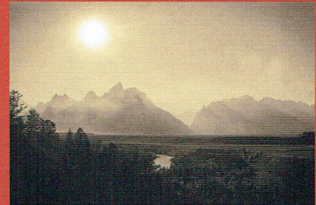
Smoke Over Snake River